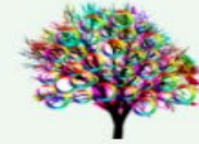
REFLECTION & FEEDBACK